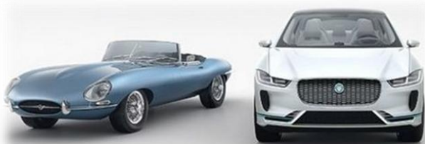
E-Type Zero ----- I-Pace

Jaguar has announced plans to electrify all of its cars by 2020. But can electric motors purr?